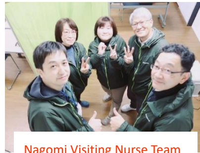
Nagomi Visiting Nurse Team

Visiting Nurse Team have started to hold discussions in preparation of putting "Crisis Plan" into actual practice. Crisis Plan is a plan (protection of rights) created based on the agreement made between us supporters and our users at the time when the user's condition is stable. The plan outlines self-coping methods that the user is to take in order to maintain a stable condition and at times when signs of worsening of symptoms is seen or when their medical condition deteriorates, and also outlines how us supporters are to respond. We will continue to work hard so that everyone is able to live with peace of mind without any worries. (Arai, Visiting Nurse)