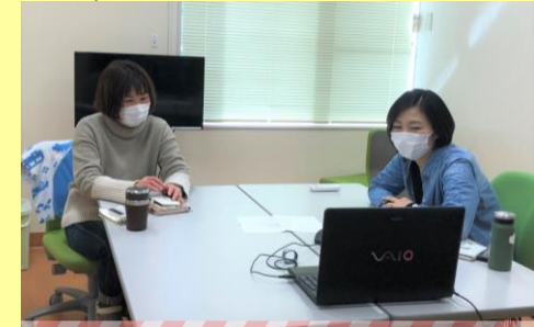
To avoid the three C's, non-committee members observed from a different room.