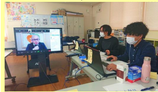
It's almost like a real TV station!