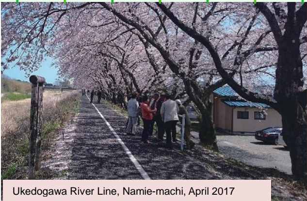
Ukedogawa River Line, Namie-machi, April 2017

Our recommendation from Natsu-shoku recipe book!