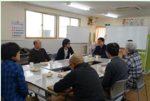
Gathering of training course alumni held in February♪

Mental Care Volunteer Training Course was held for the third time. We listened to lectures on basic knowledge regarding mental disorders and ways on how to deal with people with handicaps, and also listened to stories told by people actually suffering from mental disorders. We also had the opportunity to visit Coffee Time and Asagao, which are both Support for Continuous Employment – Type B services. Is was really a great opportunity to understand that it is possible to live actively in the local community even with mental disorders. Please let us extend our sincere appreciation to everyone who cooperated in the volunteer training course. We are planning to hold this course again next fiscal year. Details will be announced in our website and we are looking forward to your participation. (Otani)