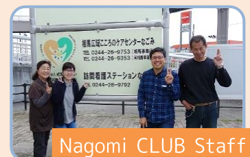
Nagomi CLUB Staff