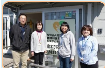
Visiting Nursing staff