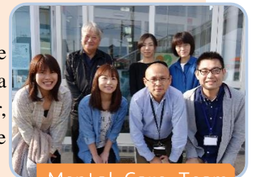
Mental Care Team