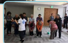
Tea party in Namie-machi,