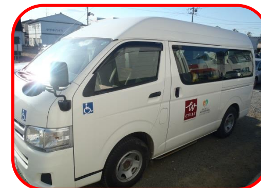
Hi-Ace donated by CWAJ