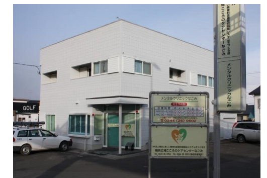
Exterior of the Clinic and Care Center