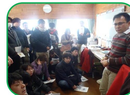
Visit by Chiba Association of PSW