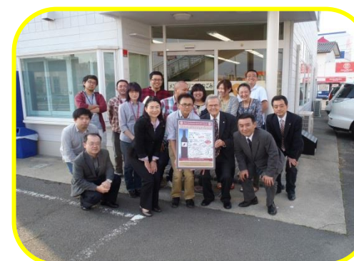
Presentation Ceremony with Rotary