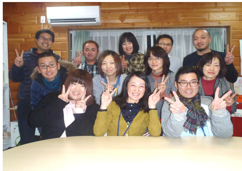
(Group photo of all the staff at Soma office in December, 2012)

Thank You Very Much for the Fiscal Year 2012!