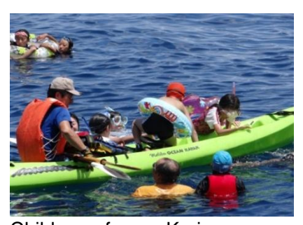
Children from Koriyama are enjoying swimming in the sea for the first time after two years

Children from Minamisoma. enjoying Hachijo Drum, which is said to be the oldest drum in Japan.