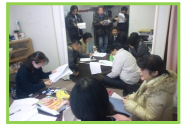
Reading through scripts. Everyone was very serious!