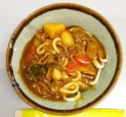
←Curry Noodles we cooked

For December, there were suggestions such as “It’s Christmas time, so let’s make snowdomes” and “It’s getting cold, and I want to have a hot dish. What shall we make on Cooking Day”? We will work on carrying out as many activities as possible that all the members can enjoy. (Abe)