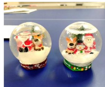
↑ Snow Domes we made